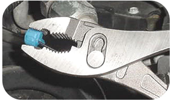
Figure 4 (Close T-Tap connector)

If you have any questions regarding the performance of your kit, call NOS Technical Service at 1-866-464-6553.