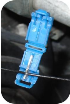
Figure 3 (T-Tap connector installation)